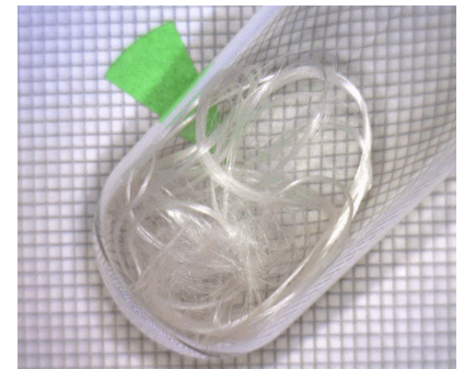
17.9mg analyzed (1mm x 1mm scale)

Disclosures: All work was done at Beta Analytic in its own chemistry lab and AMSs. No subcontractors were used. Beta's chemistry laboratory and AMS do not react or measure artificial C 14 used in biomedical and environmental AMS studies. Beta is a C14 tracer-free facility. Validating quality assurance is verified with a Quality Assurance report posted separately to the web library containing the PDF downloadable copy of this report.