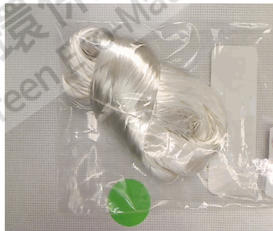
View of content (1mm x 1mm scale)